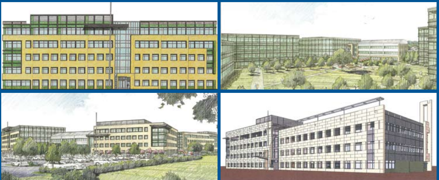
Impressive facades and attractive landscaping characterize the buildings at Mack-Cali Princeton Executive Park.

This outstanding corporate campus is backed by Mack-Cali's development expertise, award-winning property management, and solid financial resources—all combining to ensure the smooth, timely and successful completion of the project and unmatched building services thereafter.